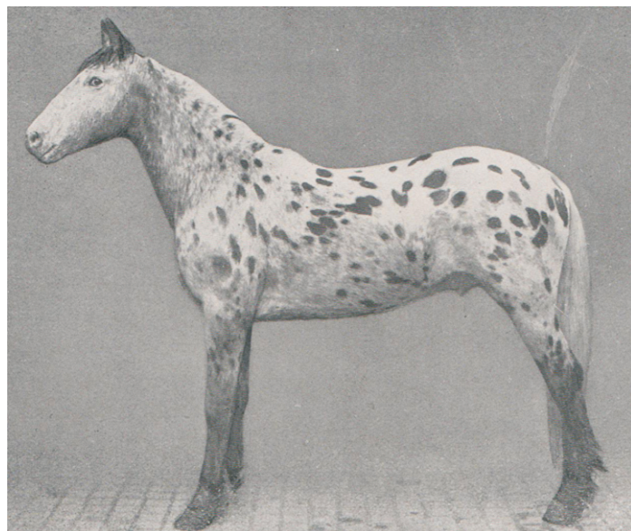
Chart 5 - Appaloosa patterns (continued)